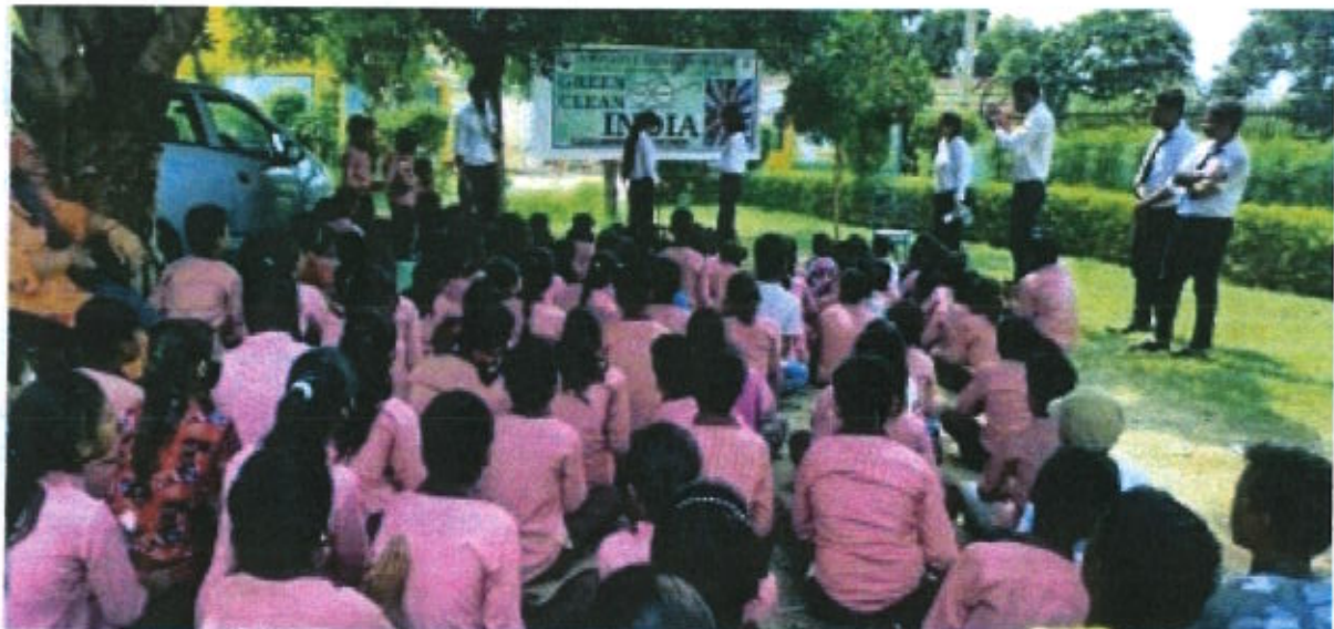
Be green to keep it clean

Plot No. - 6, Knowledge Park - 2, Greater Noida, U. P. - 201308. (Near Knowledge Park - 2 Metro Station) Ph: 0120-2328555 | Website - www.innovativepharmacy.in | E-mail: innovativepharmacy01@gmail.com