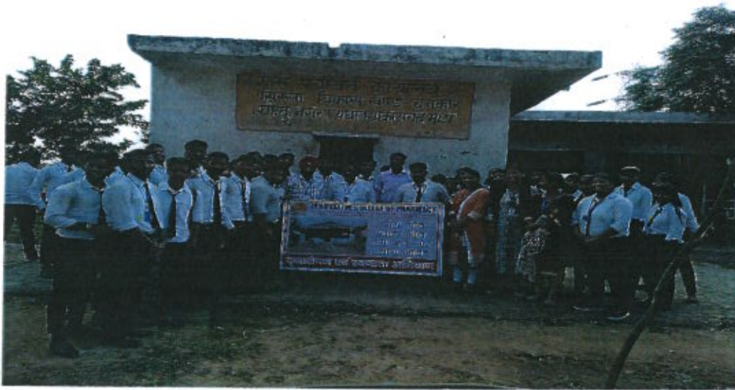
Swachh bharat mission

Affiliated To Dr. A.P.J. Abdul Kalam Technical University, Lucknow, U.P. & Approved By PCI