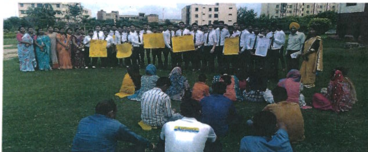
Environment day Awareness program

Affiliated To Dr. A.P.J. Abdul Kalam Technical University, Lucknow, U.P. & Approved By PCI