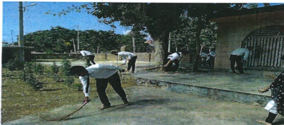
Students Participating in swachh bharat mission