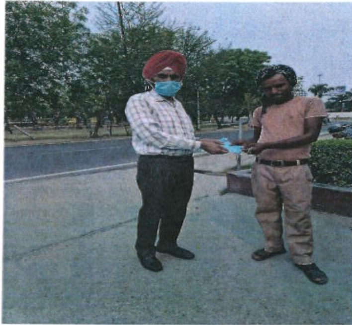
Masks distribution by Innovative college of pharmacy

Affiliated To Dr. A.P.J. Abdul Kalam Technical University, Lucknow, U.P. & Approved By PCI