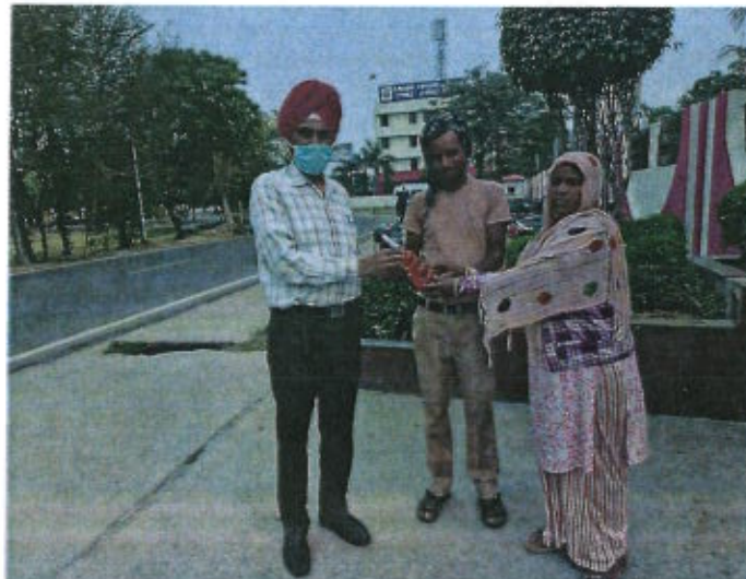
Sanitizer distribution by Innovative college of pharmacy