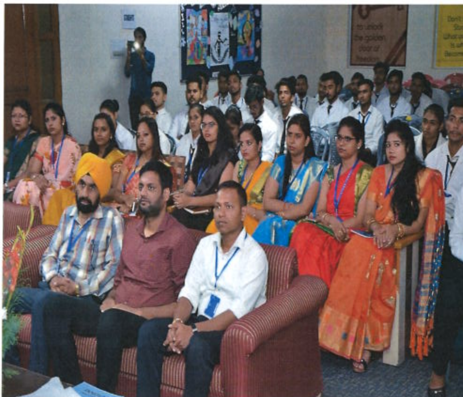
Figure 2: Photograph of faculty members with students attending a seminar on "Academic Honesty: Promoting Integrity Through Proper Citation"

Affiliated To Dr. A.P.J. Abdul Kalam Technical University, Lucknow, U.P. & Approved By PCI