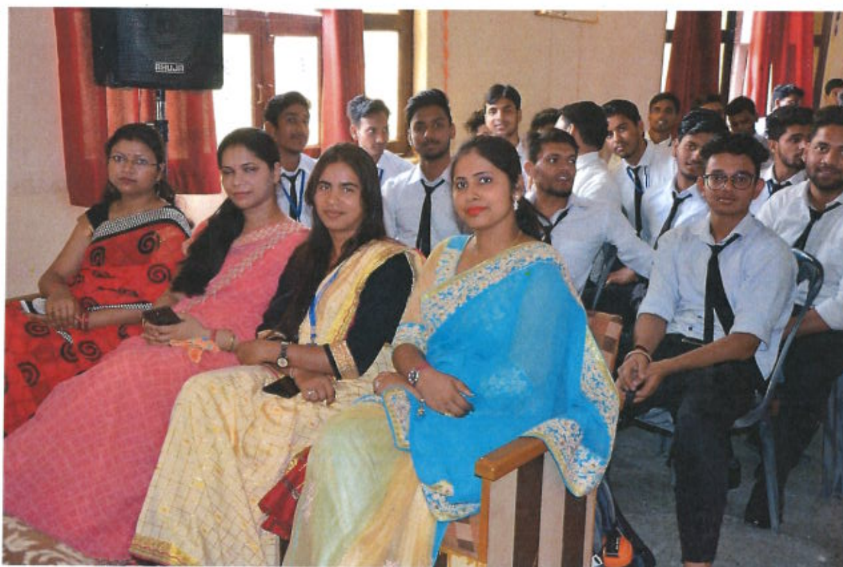
Figure 2: Photograph of faculty members with students attending a seminar on “Adverse Drug Reaction and Their Prevention OR Role of Pharmacist in the Rationale use of Medicines”

Affiliated To Dr. A.P.J. Abdul Kalam Technical University, Lucknow, U.P. & Approved By PCI