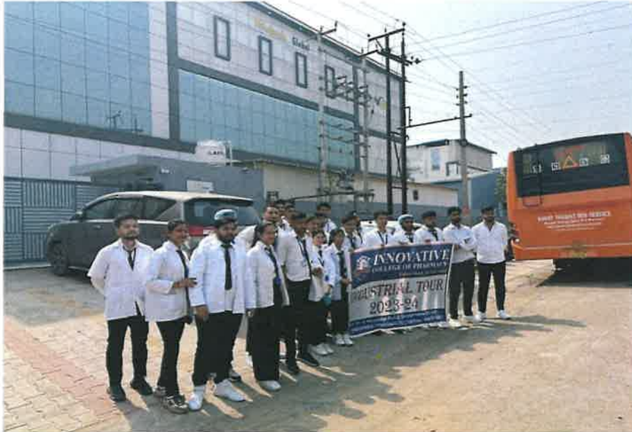
Students assemble for visiting Vrindavan Global Baddi, Himachal Pradesh

Affiliated To Dr. A.P.J. Abdul Kalam Technical University, Lucknow, U.P. & Approved By PCI