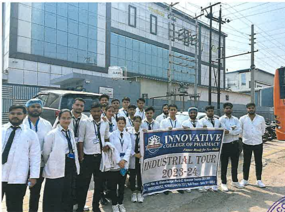
Students assemble for visiting Vrindavan Global Baddi, Himachal Pradesh