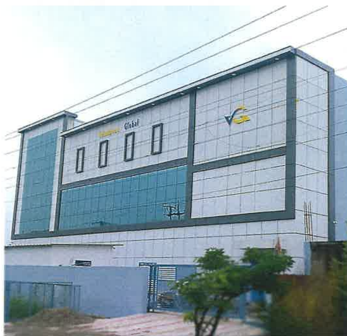
Vrindavan Global Baddi, Himachal Pradesh

Established in 2021, Vrindavan Global is India's fastest-growing pharmaceutical company. It manufactures and distributes safe, high-quality therapeutic goods approved by DCGI and FSSAI. The company supports its production with state-of-the-art manufacturing facilities and procedures. Vrindavan Global is committed to innovative research and development, providing affordable medicines for a healthier life.