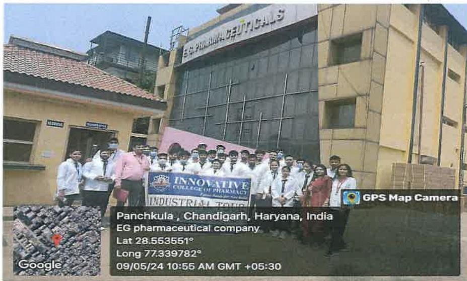
Students assemble for visiting EG Pharma, Baddi, Himachal Pradesh.