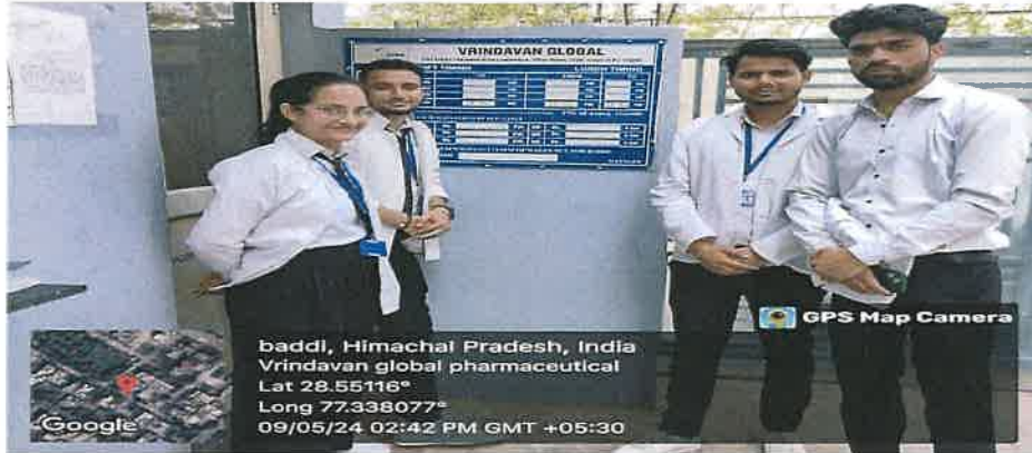
During the Industrial visit

Affiliated To Dr. A.P.J. Abdul Kalam Technical University, Lucknow, U.P. & Approved By PCI