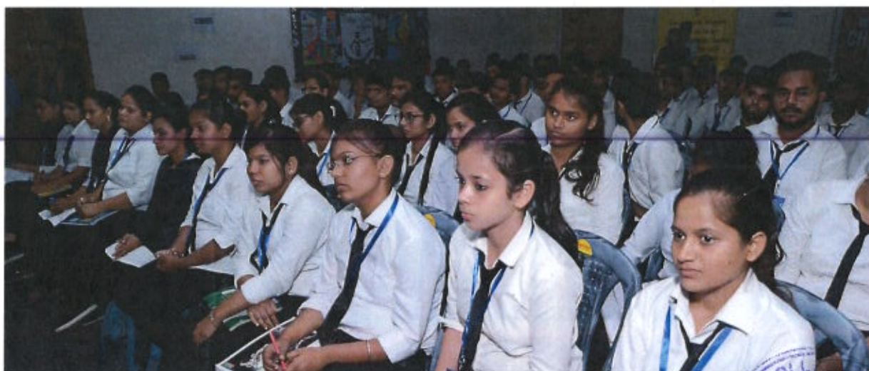
Figure 2: Photograph of faculty members with students attending a seminar on "E-Commerce Entrepreneurship: Building an Online Empire"