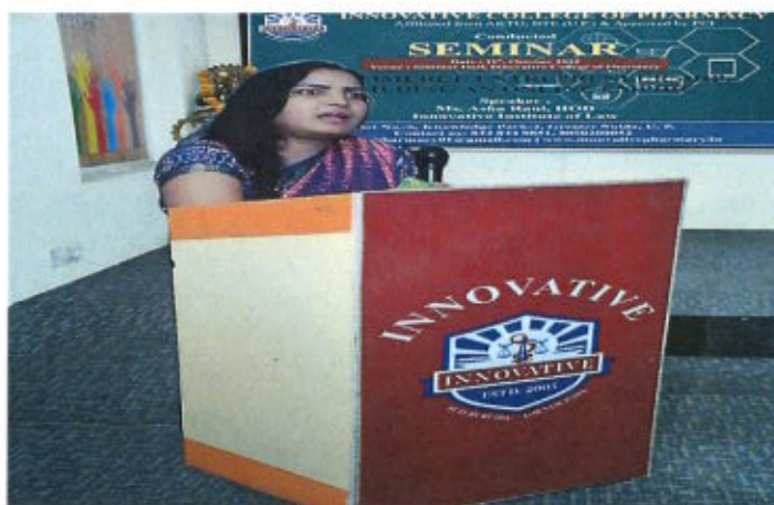
Figure 1: Photographs of honorable speaker presented valuable lecture on "E-Commerce Entrepreneurship: Building an Online Empire"