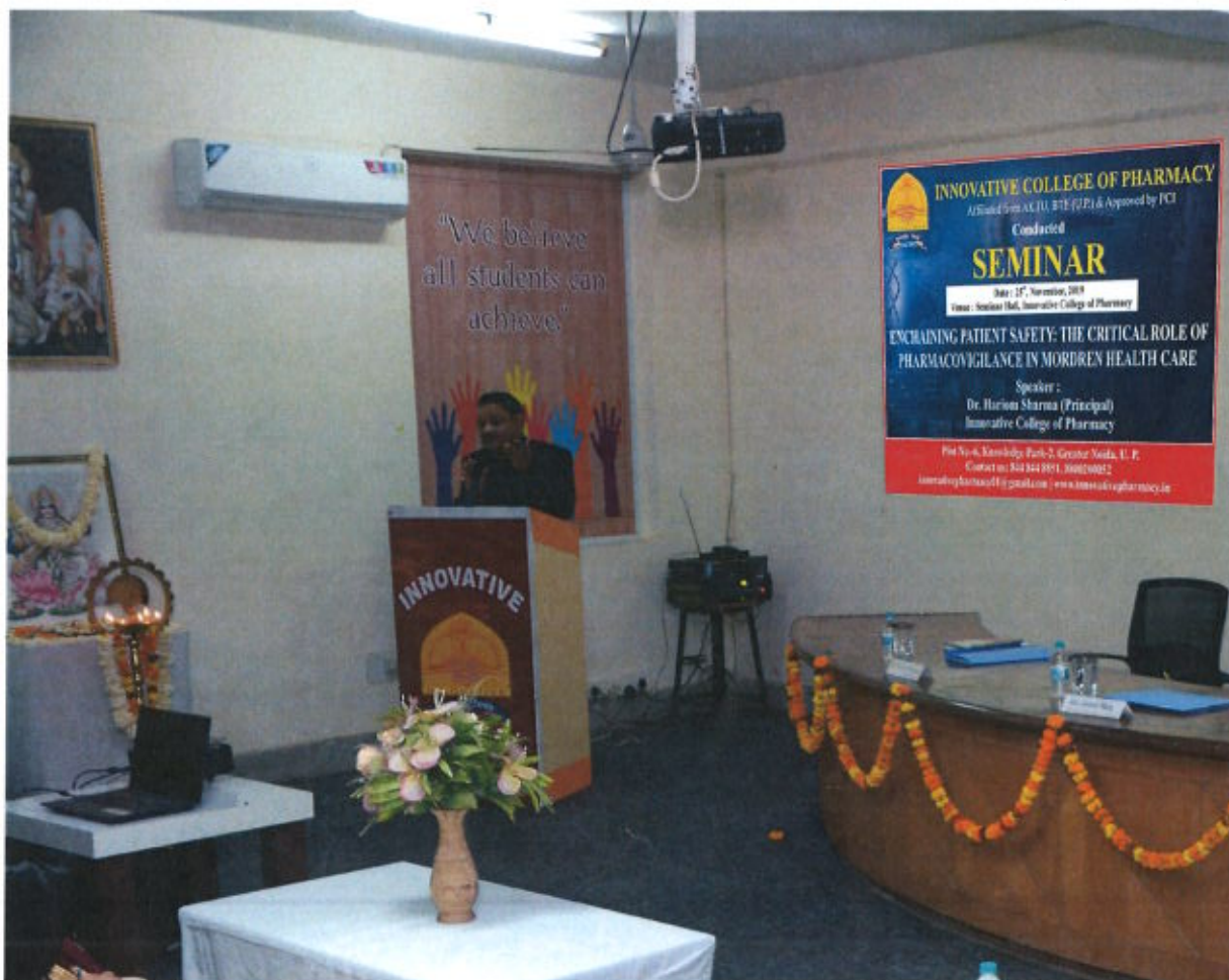
Figure 1: Photographs of speaker presented valuable lecture on “Enhancing Patient Safety: The Critical Role of Pharmacovigilance in Modern Healthcare”