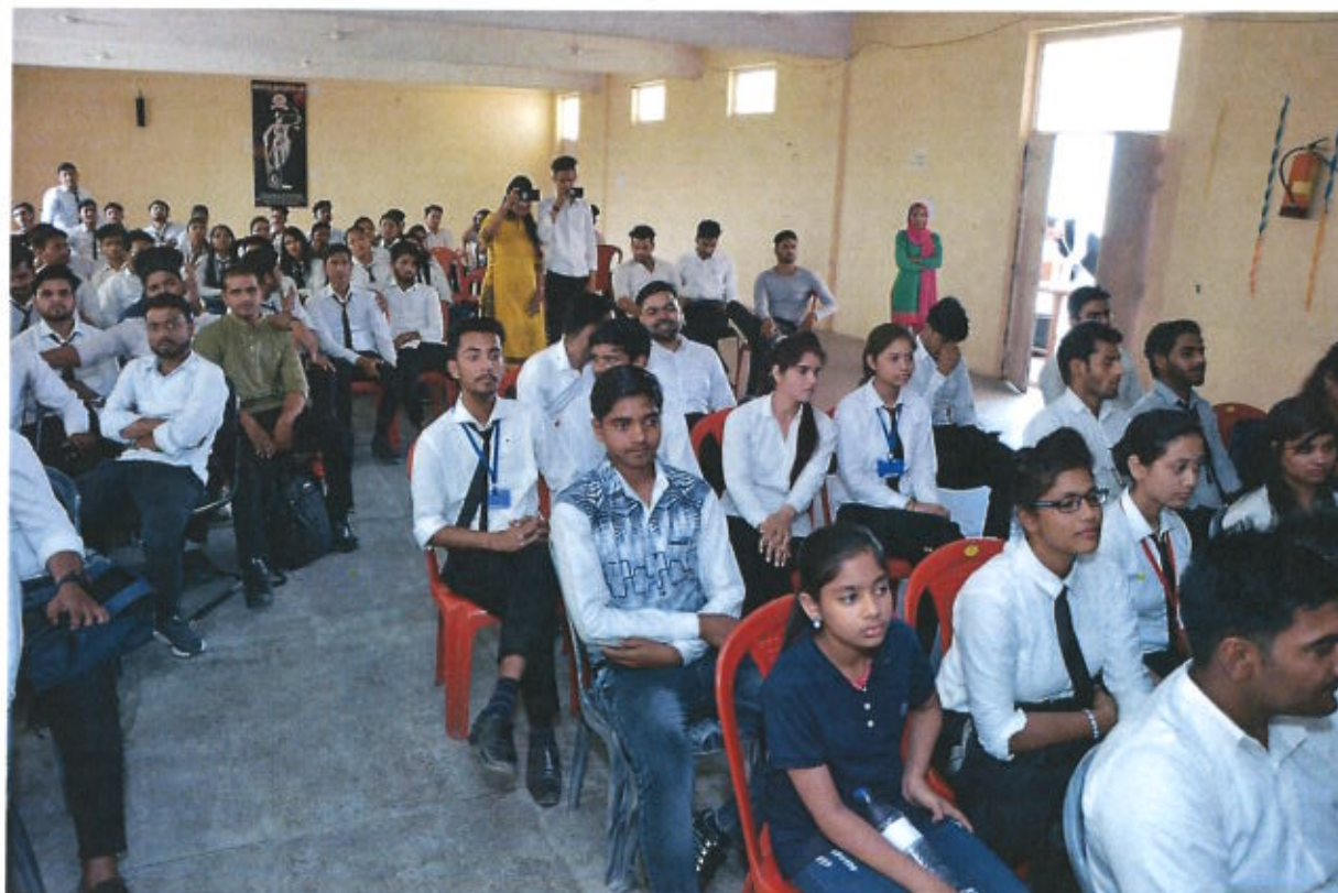
Figure 2: Photograph of faculty members with students attending a seminar on “Enhancing Patient Safety: The Critical Role of Pharmacovigilance in Modern Healthcare”

Affiliated To Dr. A.P.J. Abdul Kalam Technical University, Lucknow, U.P. & Approved By PCI