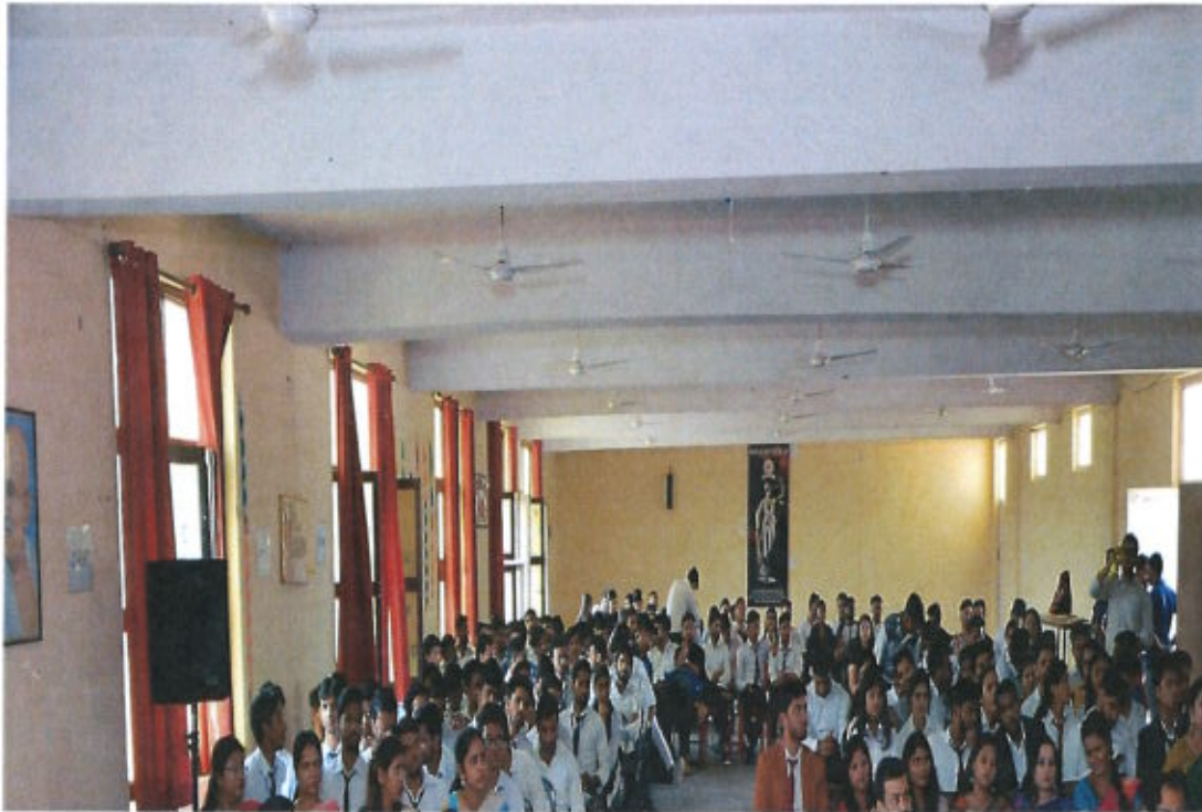
Figure 2: Photograph of faculty members with students attending a seminar on "Youth Entrepreneurship: Empowering the Next Generation of Innovators"

Affiliated To Dr. A.P.J. Abdul Kalam Technical University, Lucknow, U.P. & Approved By PCI