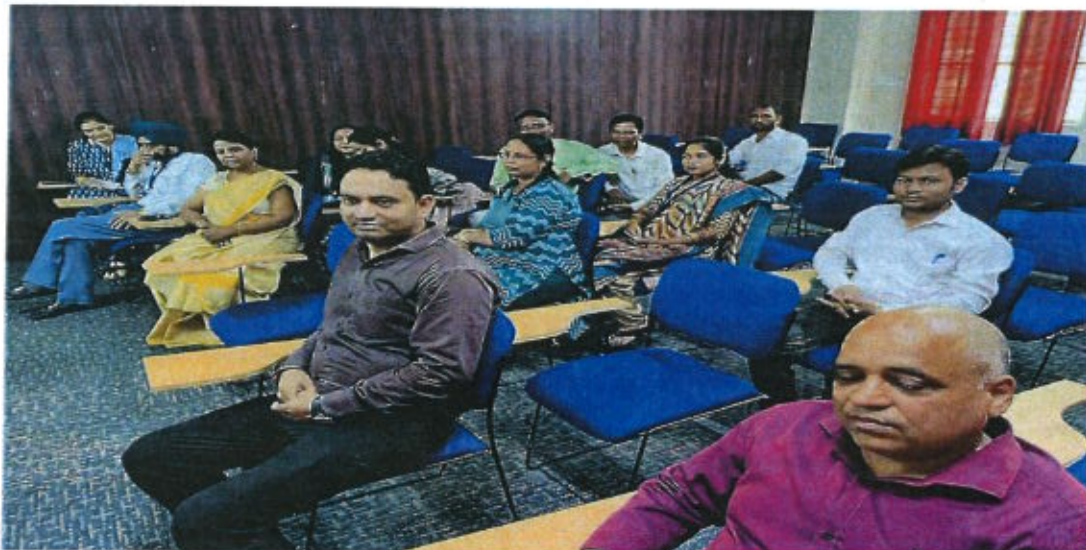
Empowered women, empower the world