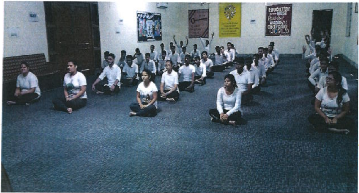
Yoga: The path to harmony

Affiliated To Dr. A.P.J. Abdul Kalam Technical University, Lucknow, U.P. & Approved By PCI