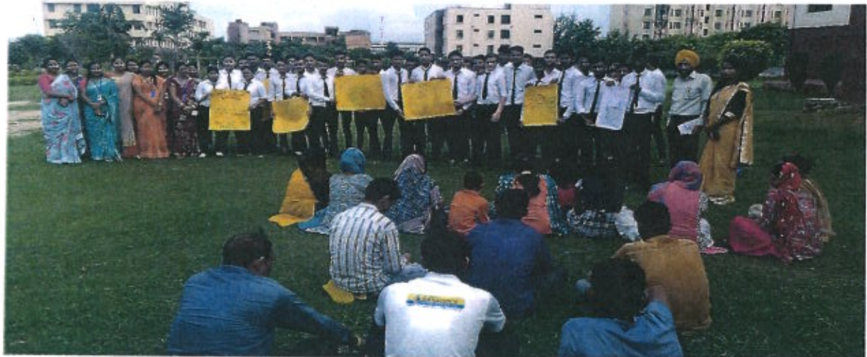
Environment day Awareness program

Affiliated To Dr. A.P.J. Abdul Kalam Technical University, Lucknow, U.P. & Approved By PCI