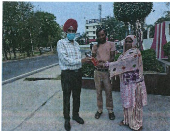
Sanitizer distribution by Innovative college of pharmacy