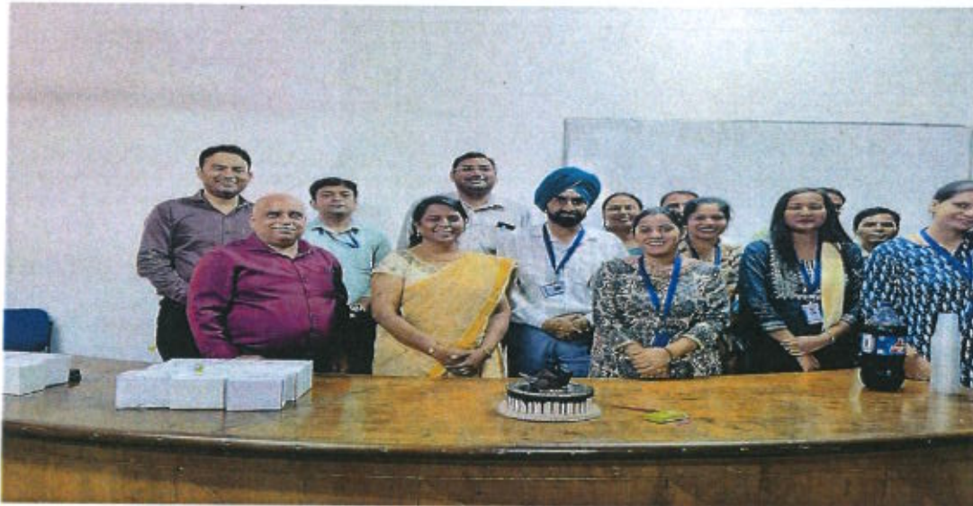
Women's Day celebration

equality, we can create a more inclusive and equitable world for all.