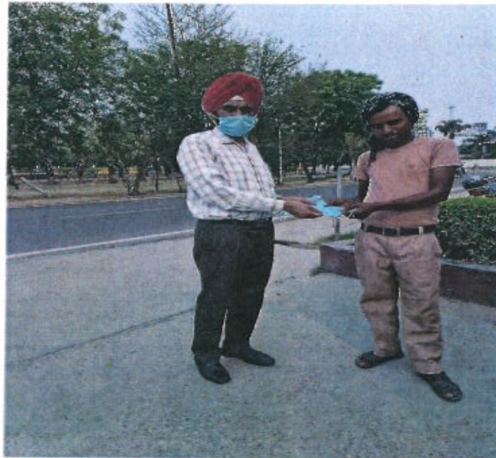
Masks distribution by Innovative college of pharmacy

Affiliated To Dr. A.P.J. Abdul Kalam Technical University, Lucknow, U.P. & Approved By PCI