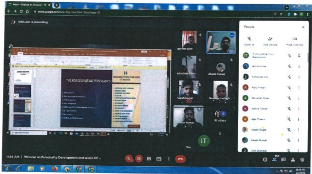
Tips for developing personality

Affiliated To Dr. A.P.J. Abdul Kalam Technical University, Lucknow, U.P. & Approved By PCI