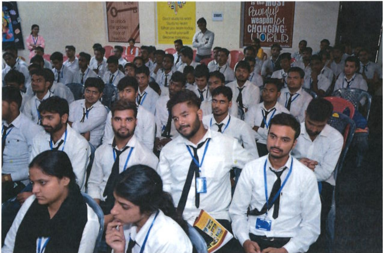
Figure 2: Photograph of faculty members with students attending a seminar on "Funding Your Dream: Exploring Venture Capital and Angel Investment"

Affiliated To Dr. A.P.J. Abdul Kalam Technical University, Lucknow, U.P. & Approved By PCI