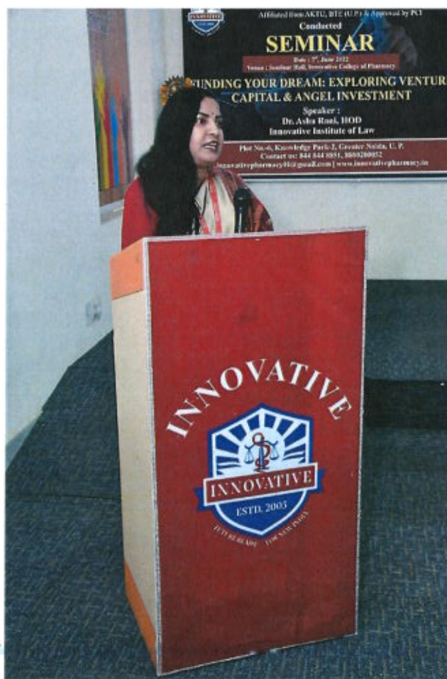
Figure1: Photographs of honorable speaker presented valuable lecture on "Funding Your Dream: Exploring Venture Capital and Angel Investment"