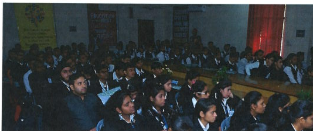
Figure 2: Photograph of faculty members with students attending a seminar on "Mastering Report Writing: Essential Steps for Success"