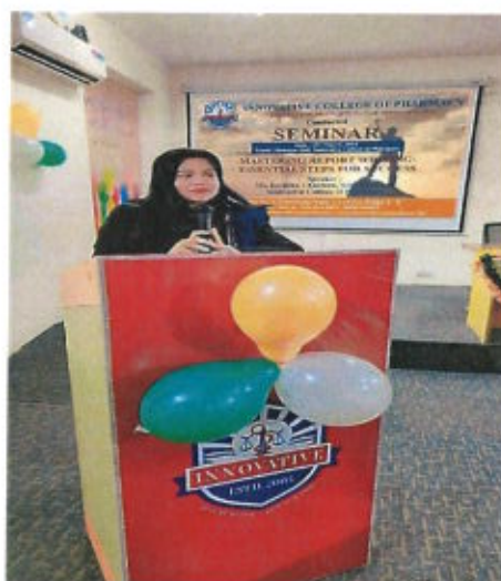
Figure 1: Photographs of honorable speaker presented valuable lecture on "Mastering Report Writing: Essential Steps for Success"