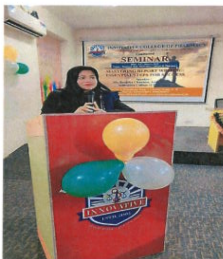
Figure 1: Photographs of honorable speaker presented valuable lecture on "Mastering Report Writing: Essential Steps for Success"