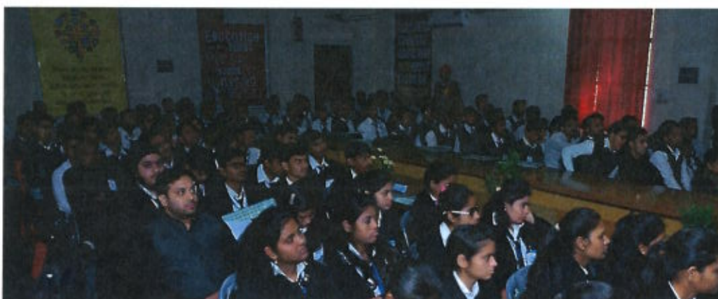
Figure 2: Photograph of faculty members with students attending a seminar on "Mastering Report Writing: Essential Steps for Success"