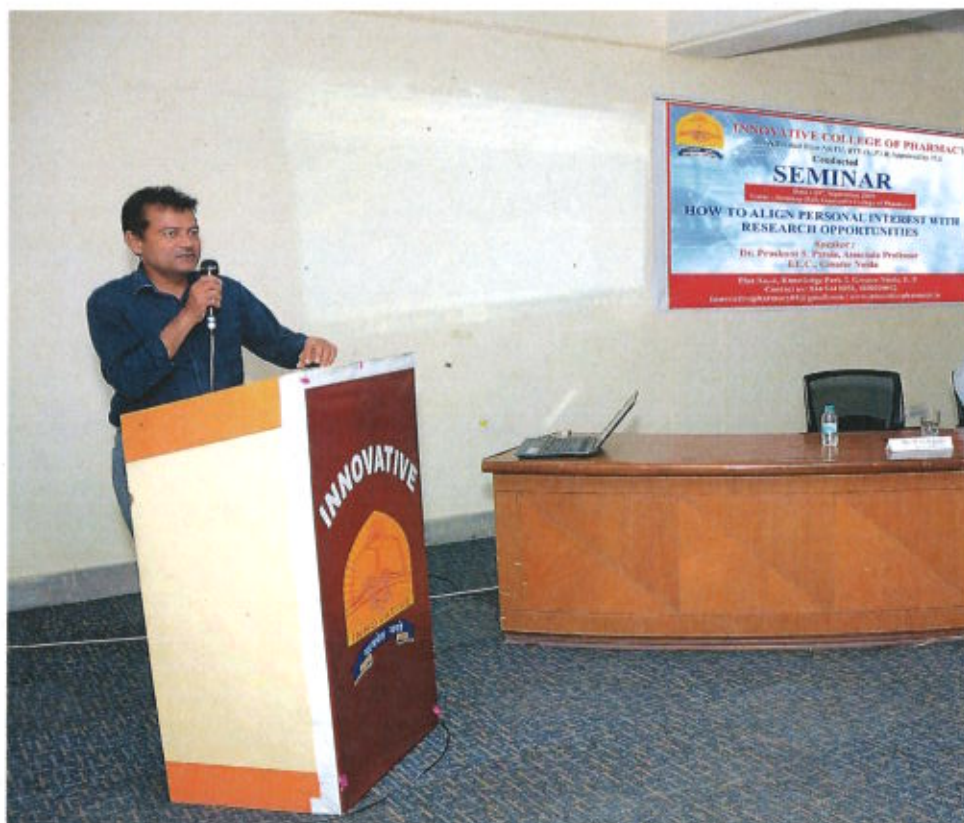
Figure I: Photographs of speaker presented valuable lecture on “How to Align Personal Interests with Research Opportunities”