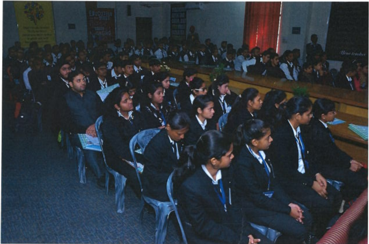
Figure 2: Photograph of faculty members with students attending a seminar on The Lean Startup Building a Business with Minimal Resources

Affiliated To Dr. A.P.J. Abdul Kalam Technical University, Lucknow, U.P. & Approved By PCI