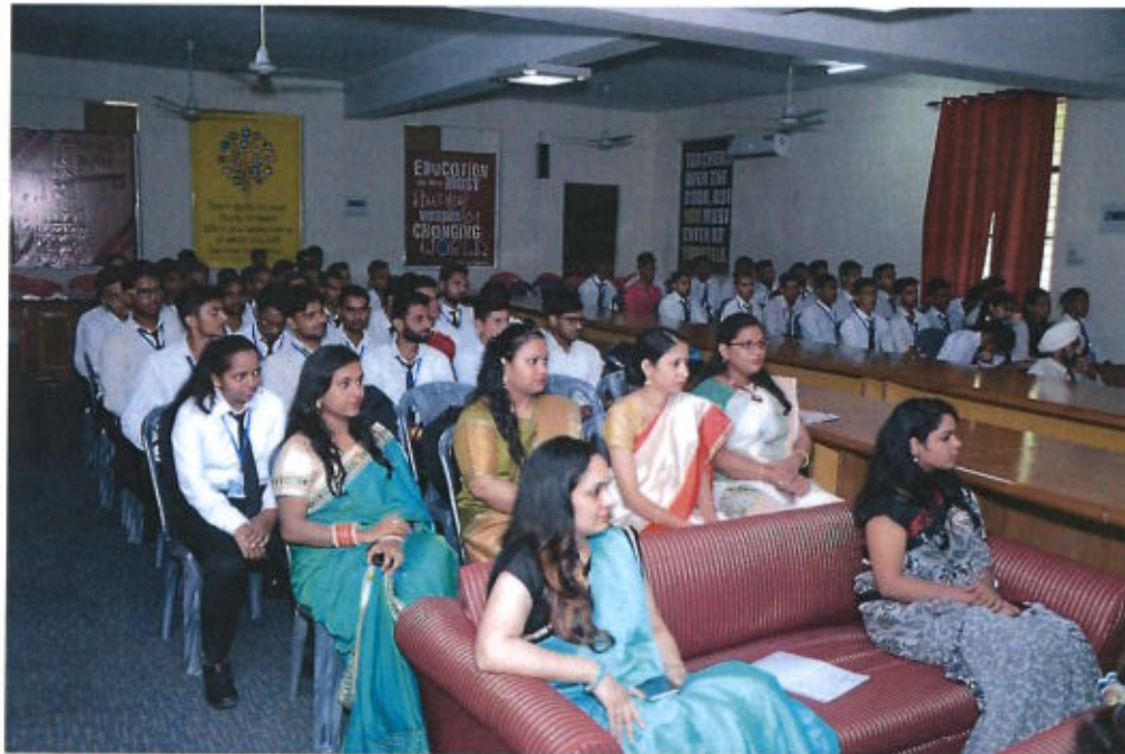
Figure2: Photograph of faculty members with students attending a seminar on “Green Business Models: Innovations in Sustainability”

Affiliated To Dr. A.P.J. Abdul Kalam Technical University, Lucknow, U.P. & Approved By PCI