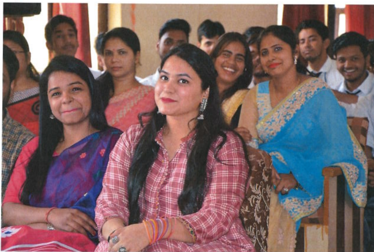
Figure 2: Photograph of faculty members with students attending a seminar on “How to Align Personal Interests with Research Opportunities”

Affiliated To Dr. A.P.J. Abdul Kalam Technical University, Lucknow, U.P. & Approved By PCI