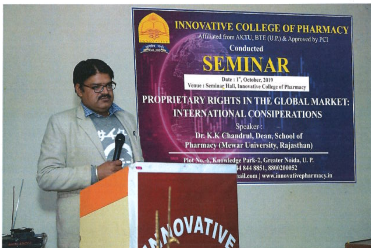
Figure 1: Photographs of speaker presented valuable lecture on “Proprietary Rights in the Global Market: International Considerations”