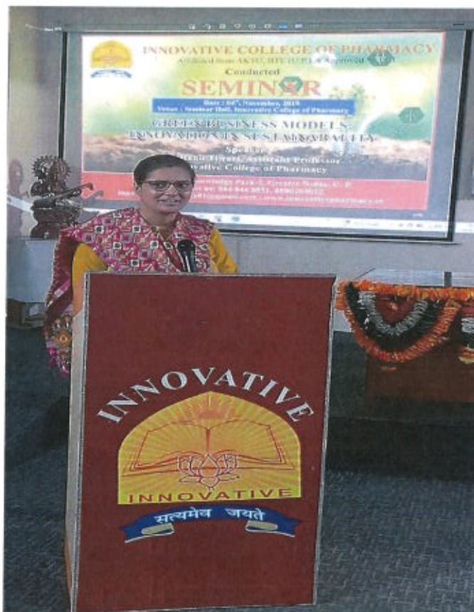
Figure1: Photographs of speaker presented innovative lecture on “Green Business Models: Innovations in Sustainability”