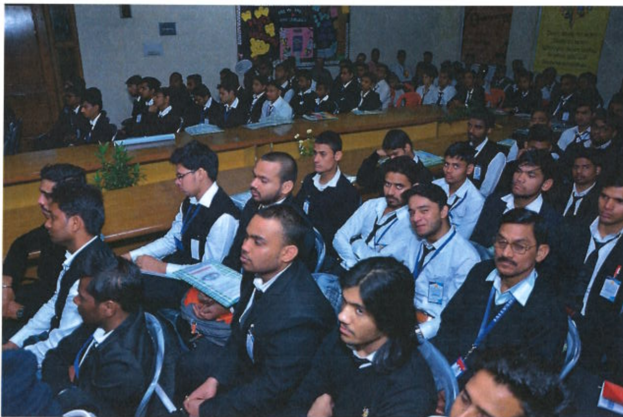
Figure 2: Photograph of faculty members with students attending a seminar on "Workshops and Seminars: Sources of Research Topic Ideas"

Affiliated To Dr. A.P.J. Abdul Kalam Technical University, Lucknow, U.P. & Approved By PCI