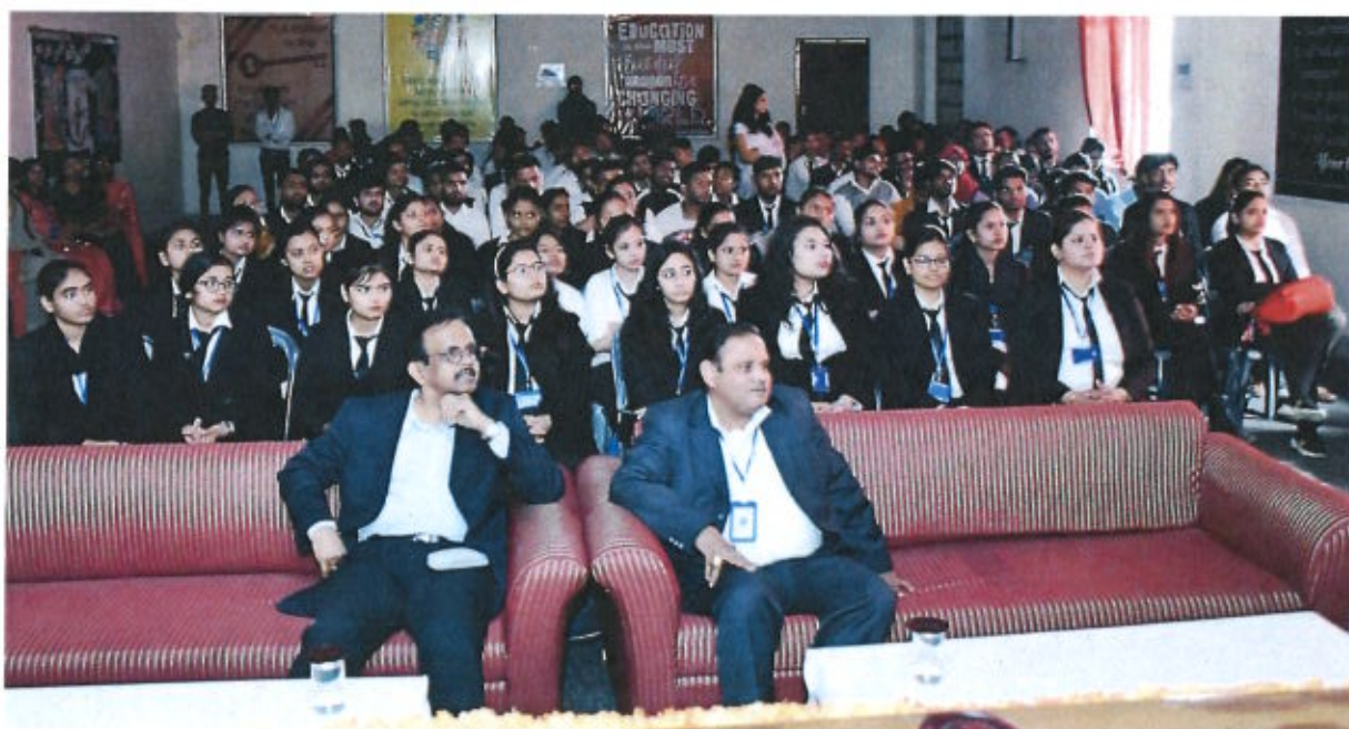
Figure 2: Photograph of faculty members with students attending a seminar on "Writing Mechanics: Perfecting Your Research Report"

Affiliated To Dr. A.P.J. Abdul Kalam Technical University, Lucknow, U.P. & Approved By PCI