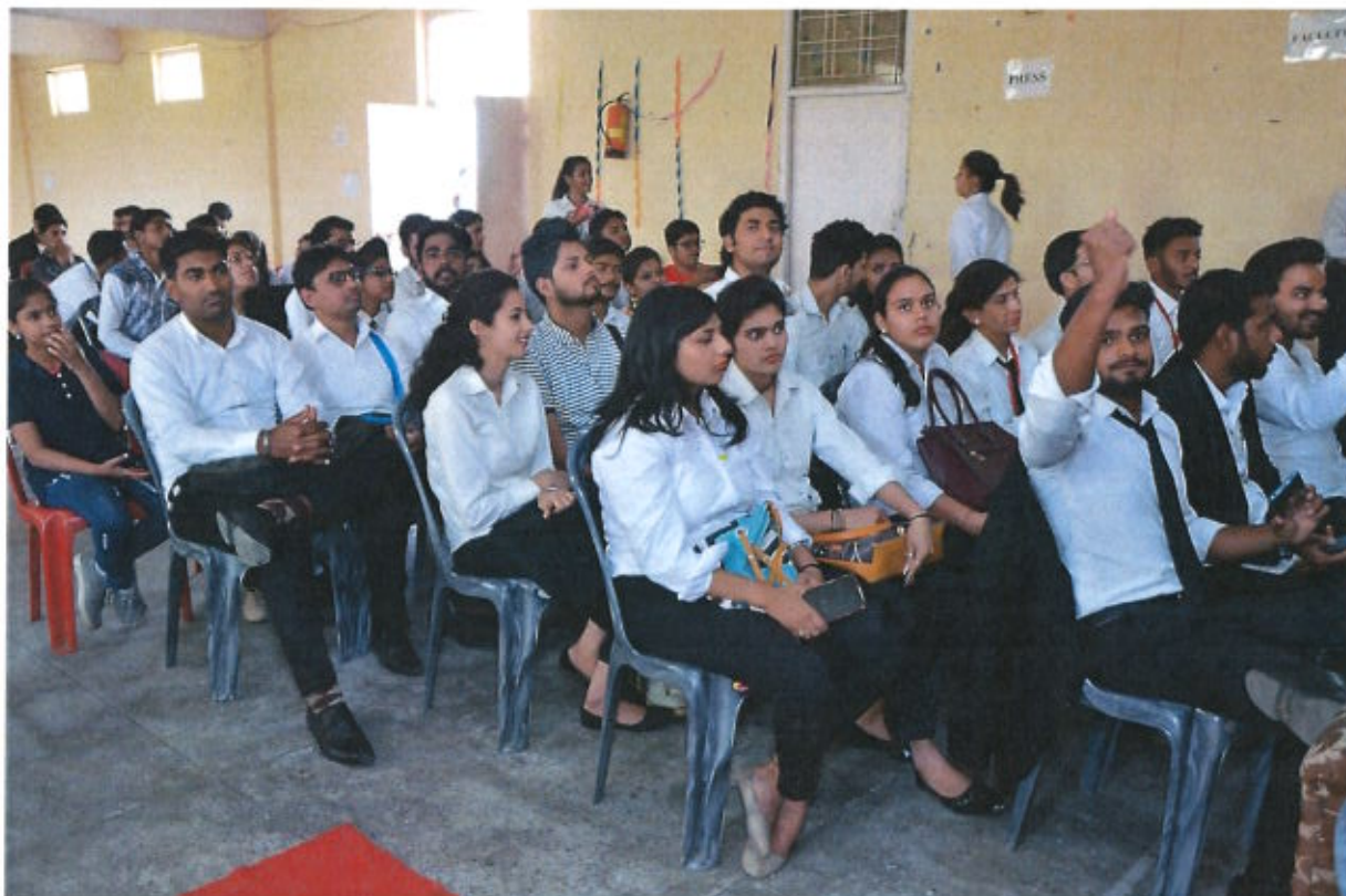
Figure 2: Photograph of faculty members with students attending a seminar on “Proprietary Rights in the Global Market: International Considerations”

Affiliated To Dr. A.P.J. Abdul Kalam Technical University, Lucknow, U.P. & Approved By PCI