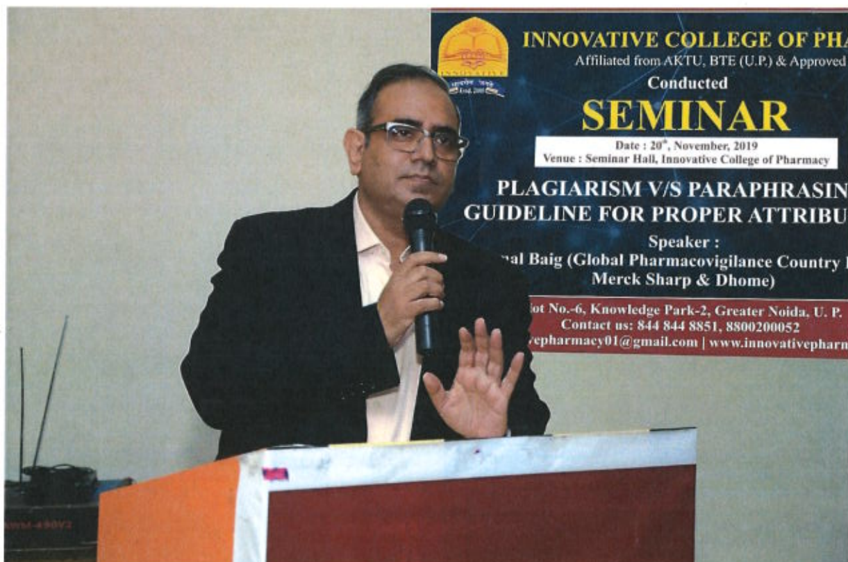
Figure1: Photographs of speaker presented valuable lecture on "Plagiarism vs. Paraphrasing: Guidelines for Proper Attribution"