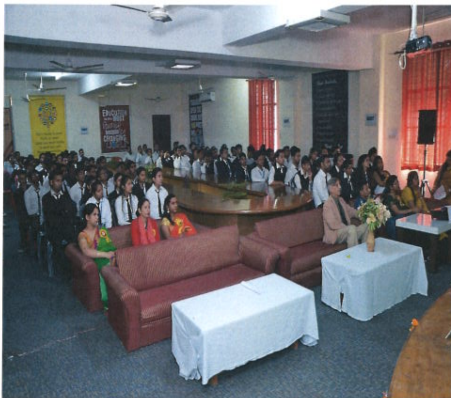
Figure 2: Photograph of faculty members with students attending a seminar on “Ethical Considerations in Research Design Ensuring Integrity and Compliance”

Affiliated To Dr. A.P.J. Abdul Kalam Technical University, Lucknow, U.P. & Approved By PCI