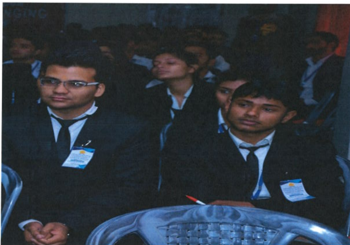
Figure 2: Photograph of faculty members with students attending a seminar on Next-Generation Entrepreneurship Opportunities in Emerging Industries

Affiliated To Dr. A.P.J. Abdul Kalam Technical University, Lucknow, U.P. & Approved By PCI