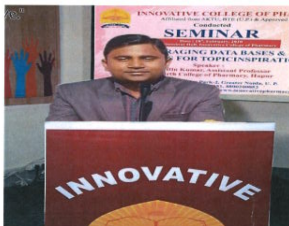
Figure 1: Photographs of speaker presented valuable lecture on Leveraging Databases and Journals for Topic Inspiration