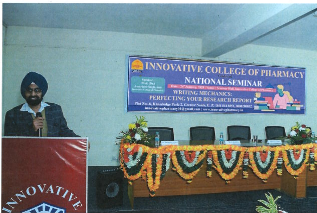
Figure1: Photographs of speaker presented valuable lecture on "Writing Mechanics: Perfecting Your Research Report"