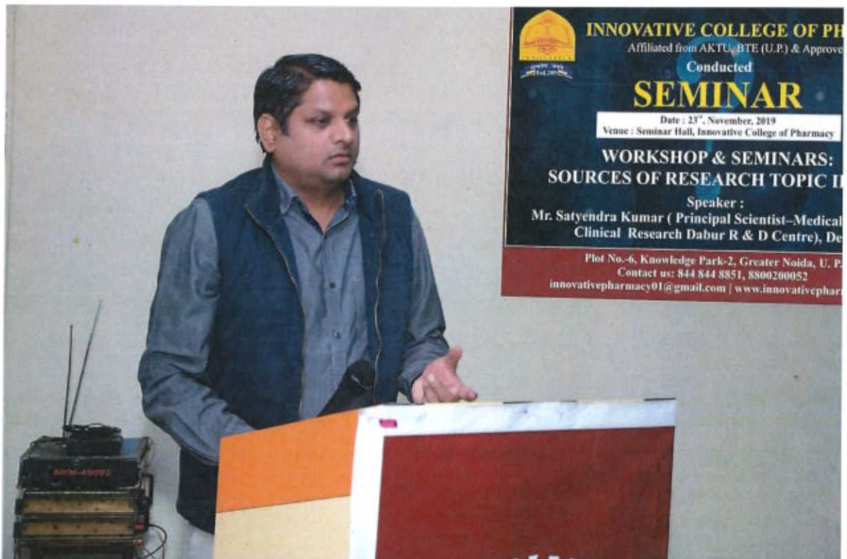
Figure 1: Photographs of speaker presented valuable lecture on "Workshops and Seminars: Sources of Research Topic Ideas"