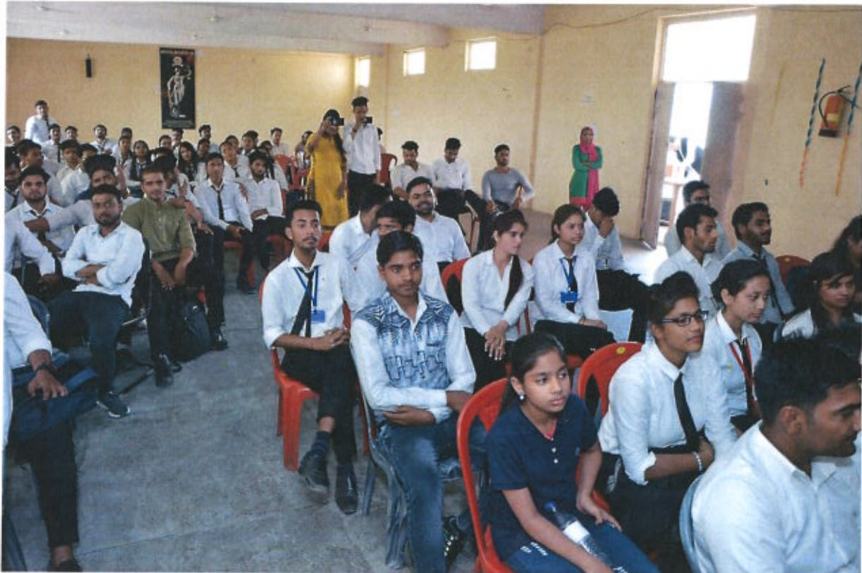
Figure 2: Photograph of faculty members with students attending a seminar on “Enhancing Patient Safety: The Critical Role of Pharmacovigilance in Modern Healthcare”

Affiliated To Dr. A.P.J. Abdul Kalam Technical University, Lucknow, U.P. & Approved By PCI