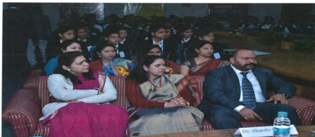
Figure 3: Photograph of faculty members with students attending a seminar on "Plagiarism vs. Paraphrasing: guidelines for proper attribution"