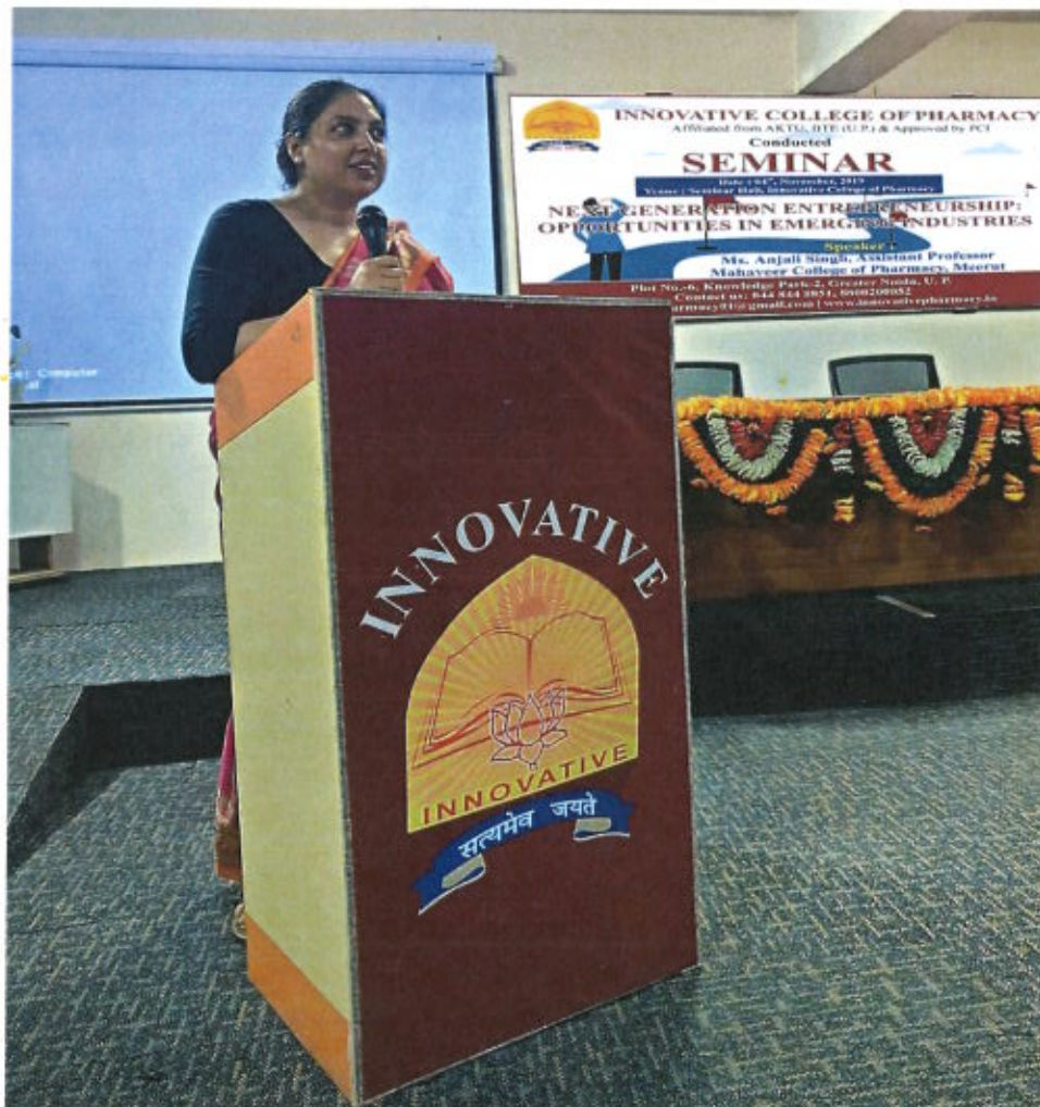
Figure1: Photographs of speaker presented valuable lecture on Next-Generation Entrepreneurship Opportunities in Emerging Industries