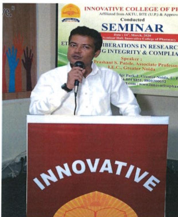
Figure 1: Photographs of speaker presented valuable lecture on “Ethical Considerations in Research Design Ensuring Integrity and Compliance”