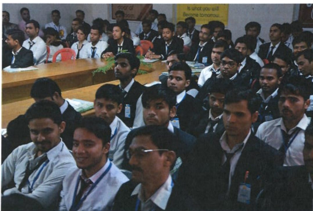
Figure 2: Photograph of faculty members with students attending a seminar on “Self-Plagiarism: Understanding and Avoiding Unintentional Duplication”

Affiliated To Dr. A.P.J. Abdul Kalam Technical University, Lucknow, U.P. & Approved By PCI