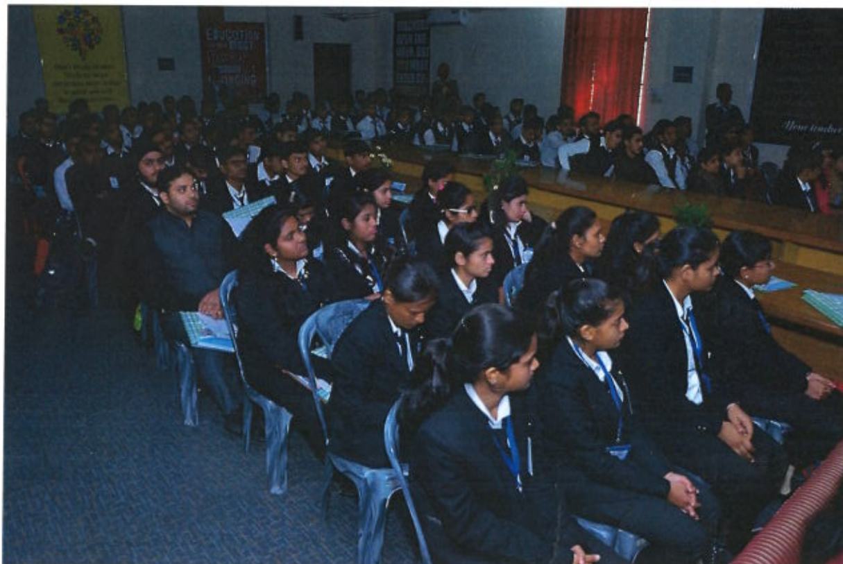
Figure 2: Photograph of faculty members with students attending a seminar on The Lean Startup Building a Business with Minimal Resources

Affiliated To Dr. A.P.J. Abdul Kalam Technical University, Lucknow, U.P. & Approved By PCI