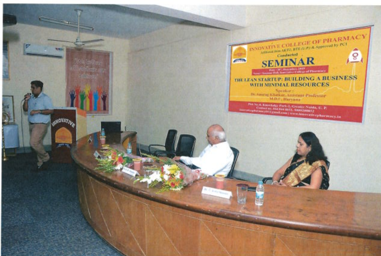
Figure1: Photographs of speaker presented valuable lecture on The Lean Startup Building a Business with Minimal Resources